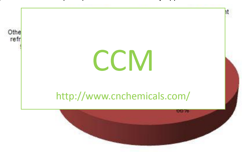
Figure 4.4-2 Consumption pattern of HFC-152a by application field in China, H1 2017