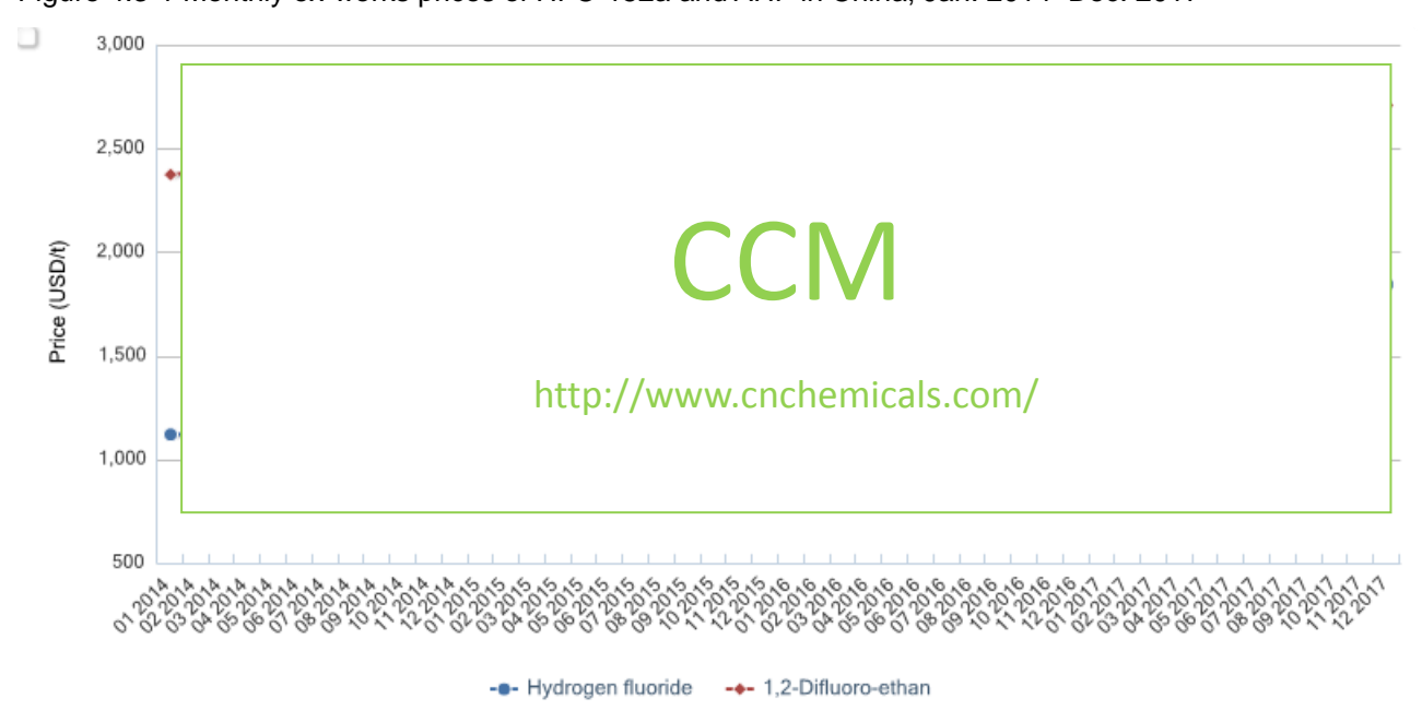
Figure 4.3-1 Monthly ex-works prices of HFC-152a and AHF in China, Jan. 2014-Dec. 2017