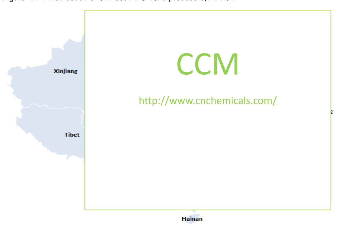
Figure 4.2-1 Distribution of Chinese HFC-152a producers, H1 2017